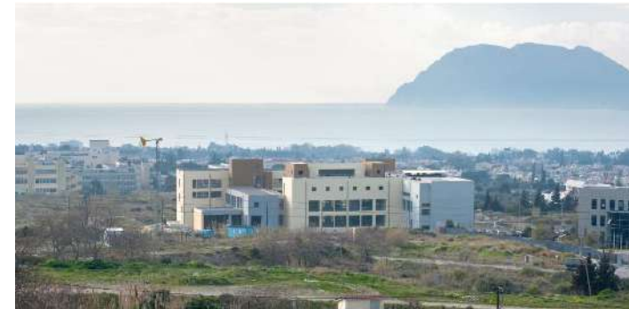
The new Building of the Department of Computer Engineering & Informatics