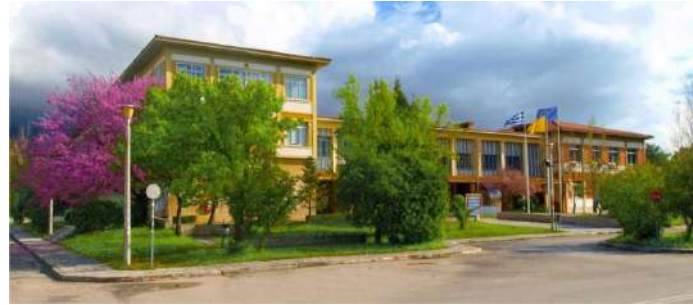
University of Patras - Administration Building