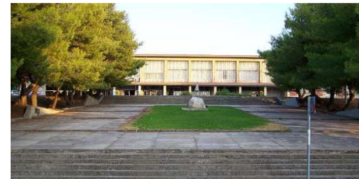
Building of the Department of Computer Engineering & Informatics